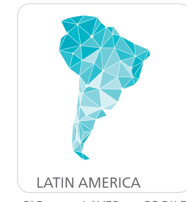
PIG LAYER BROILER $389.70 $433.20 $466.60